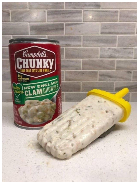
Fig 0: "Do Nothing" represented as a chowder popsicle because nobody wants it and it shouldn't even be part of the conservation