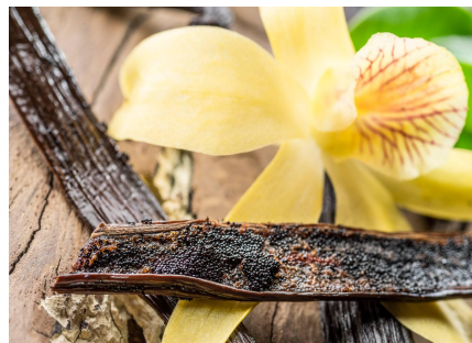
Fig 1: "Move Team Racing Nationals" represented as vanilla since it is inoffensive but unambitious