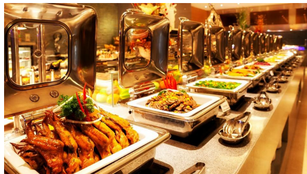
Fig 3: "Partially Split Seasons" represented as a buffet since you can pick exactly what you want