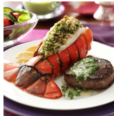
Fig 4: "Split Seasons" represented as a surf and turf plate since there is a clear separation between food groups but you can still enjoy both at the same time should you want to