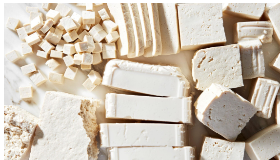
Fig 2: "Move Semifinals" represented as tofu because it is bland and unobjectionable