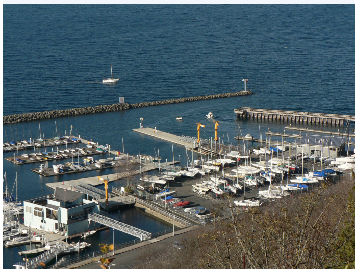
Shilshole Bay Marina_29005.jpg