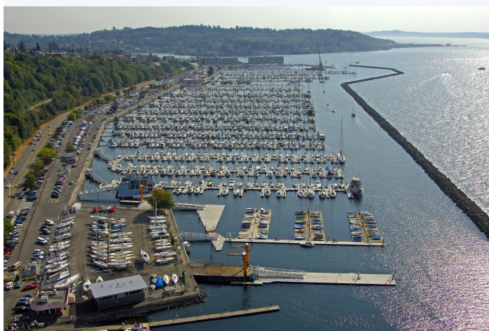
Looking South to West Point.jpg