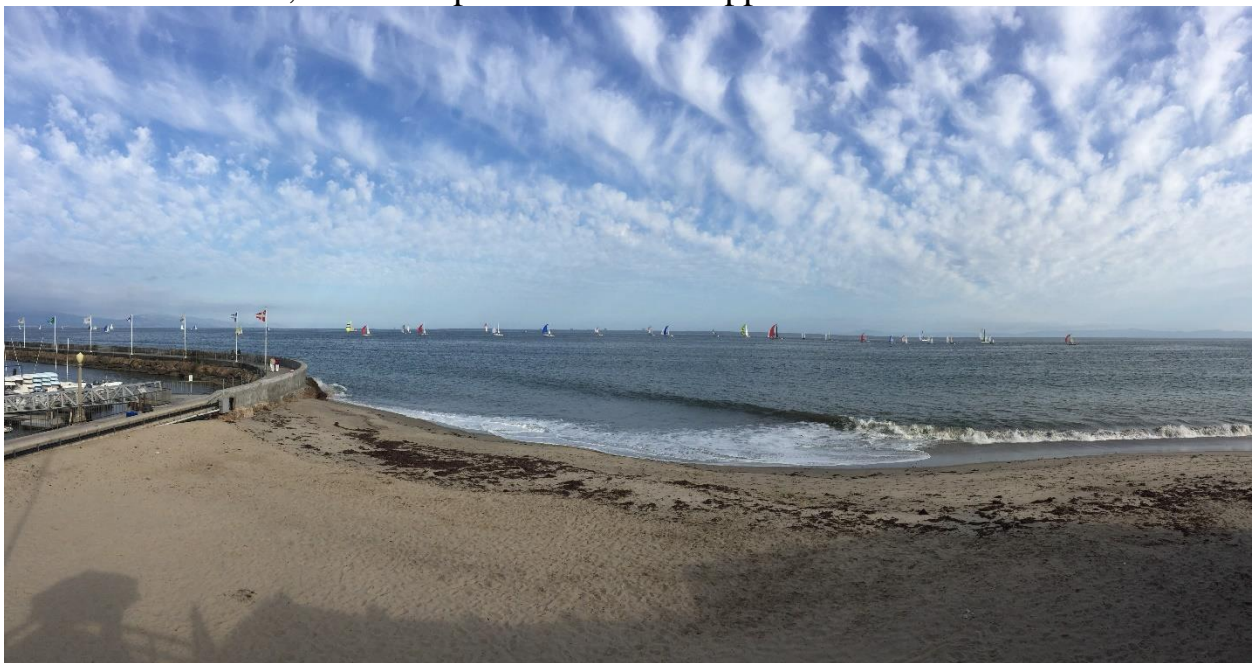
*Panoramic view of the racing venue from the SBYC club house. Break wall is to the left.