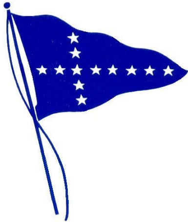
SEAWANHAKA CORINTHIAN YACHT CLUB